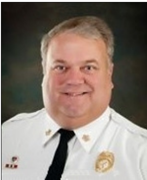
Board of Director