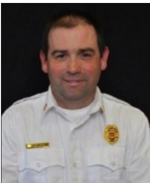
Board of Director

317-417-9758 (work) 812-291-0059 (cell) 812-885-2526 (fax)