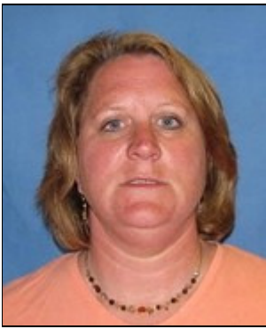
Board of Director